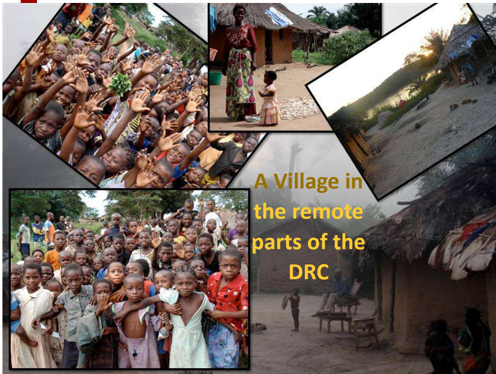
A Village in the remote parts of the DRC

The Happy Hearts team wants to thank everyone that prayed during this time and want to encourage you to not give up and keep on praying.