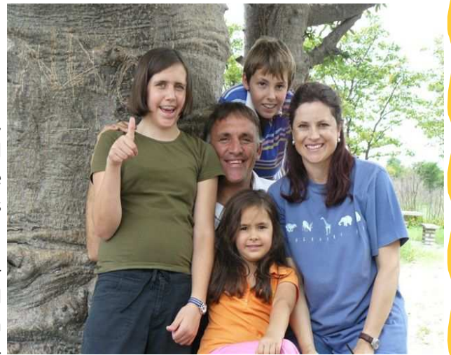
Family in Zambia: What a privilege to have a beautiful wife and children! All serving the living God with a passion!

No one really wanted to return, and therefore they all are anticipating their migration to Zambia in April this year. Their stories makes all who hear it want to join them in moving to Zambia.