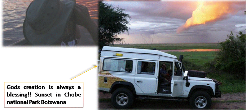
Gods creation is always a blessing!! Sunset in Chobe national Park Botswana