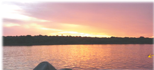
No arguments! When drifting down the Zambezi at sunset, everything inside of you are screaming! Life is good because God is good!