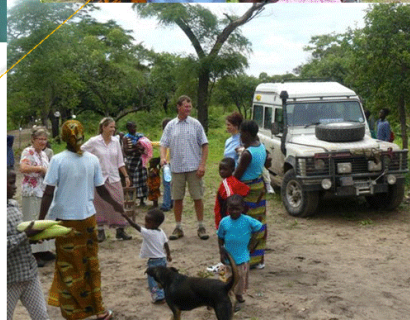
After a church service in remote western Zambia